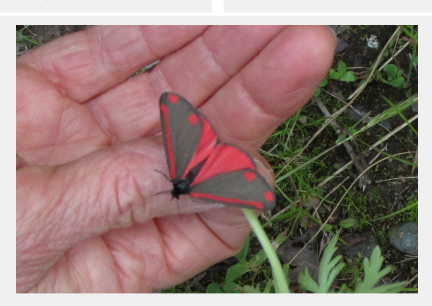
Cinnabar moth ( Tyria jacobaeae )