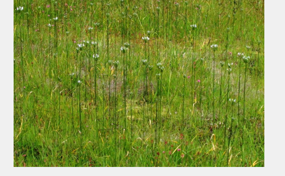
Fools Onion ( Triteleia hyacinthina )