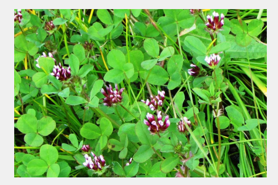
White tipped clover ( Trifolium variagatum )