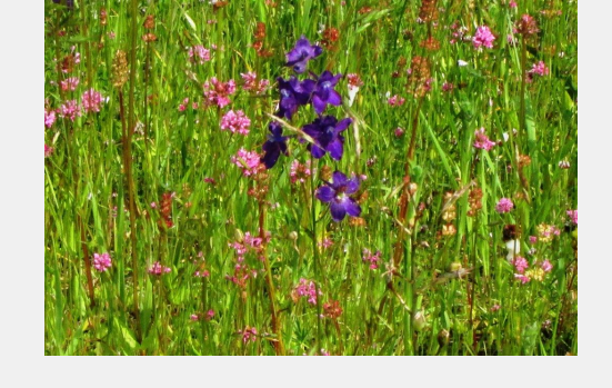
Menzies Larkspur ( Delphinium menziesii )